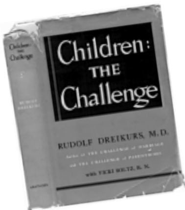
We've come a long way since Children: The Challenge , but many continue to use it. Did you know: it's perennially among international all-time best sellers.

Modern mothers and fathers are as able as those who first used the